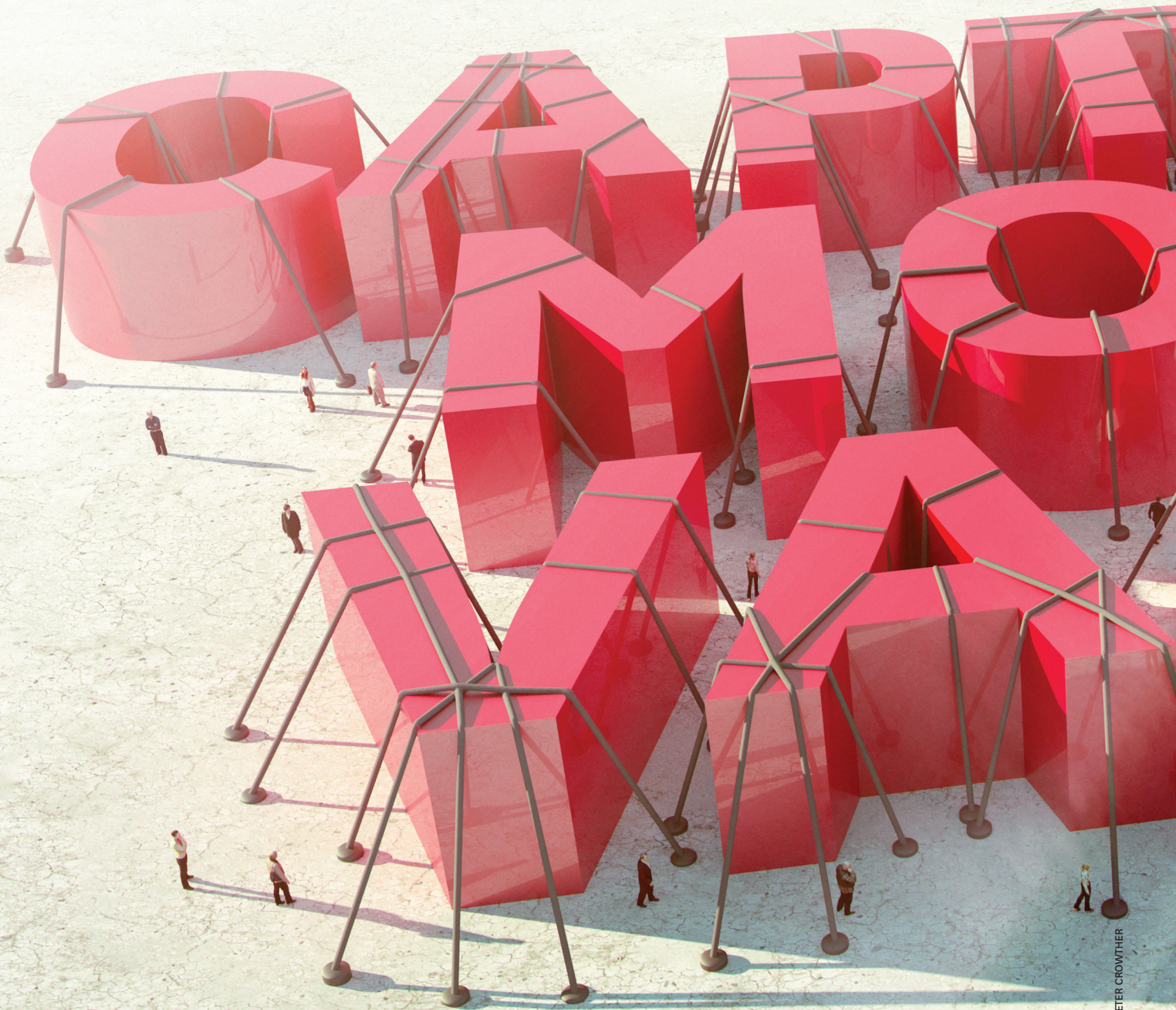
ILLUSTRATION: PETER CROWTHER